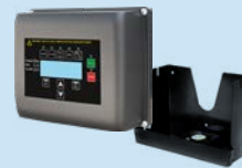
Self vented wall support

POOL4-I is the new generation of Commercial pool pumps integrating a new frequency inverter to get a great comfort and minimize the energy costs. The system allows the programming of several daily filtration cycles with different operating speed for each cycle. In installations with several POOL4-I the pumps automatically communicate and alternate to work the same amount of hours. Capable to work more than one pump at the same time.