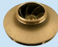
Bronze impeller (on request)

Pump ideal for countercurrent swimming installation and can be used in water parks, fountains, waterfalls, etc. The pump body in polypropylene reinforced with glass fiber allows it to resist the chemicals of the pools and guarantee excellent durability.